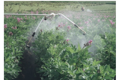
Potato boom - code 4306