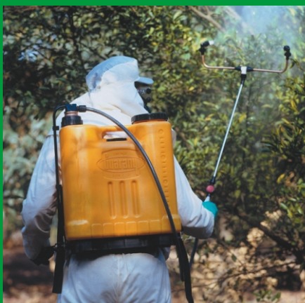
Universal boom - code 9798 - optional accessory