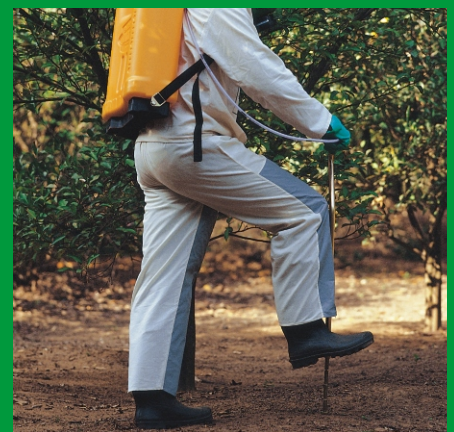
Soil injector - code 4575 - optional accessory