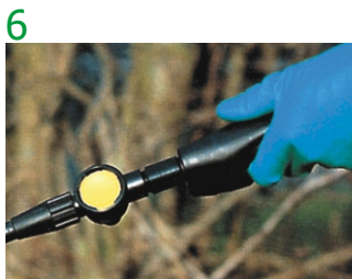
Eezispray valve - code 9984